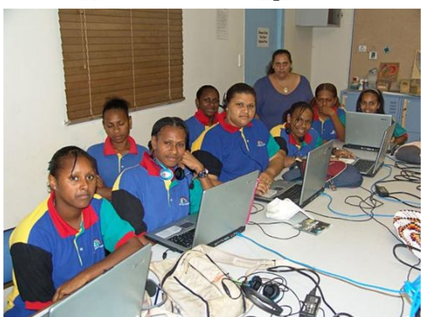
"What we have to learn to do, we learn by doing" Aristotle