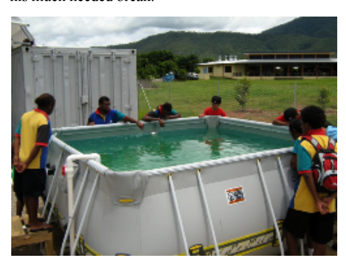
Weekdays provide many watchful eyes over the fish tanks